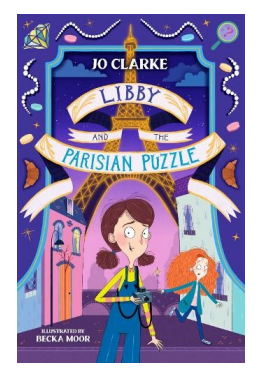
I am currently reading a fun mystery set in Paris written by a primary school librarian!

Please encourage children to keep reading while the school library is closed. Every child in school should be reading or read to for at least 20 minutes every day. Haringey's public libraries have lots of children's books!