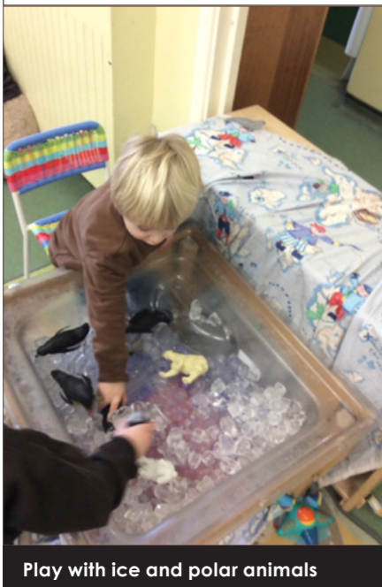
Play with ice and polar animals

We don't often feature pictures of our fabulous nursery children so in this newsletter we thought we would give you a small snap shot into their day.