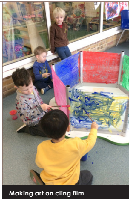
Making art on cling film