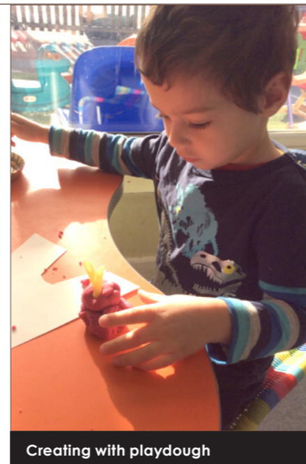
Creating with playdough