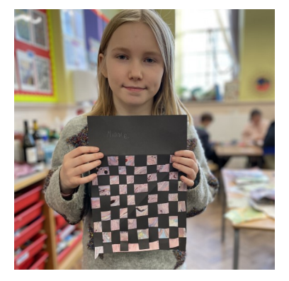
We then used our marbled paper to create some woven masterpieces. Well done year 5, you used all your skills to produce some stunning work!